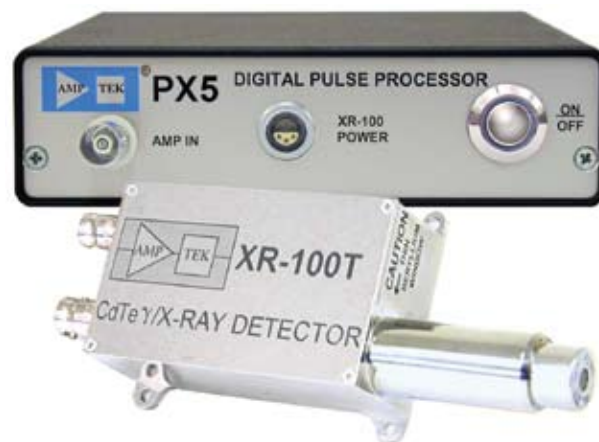
XR-100T-CdTe Gamma Ray and X-Ray Detector shown with Amptek PX5 Digital Pulse Processor

All Solid State Design - - - No Liquid Nitrogen!!!