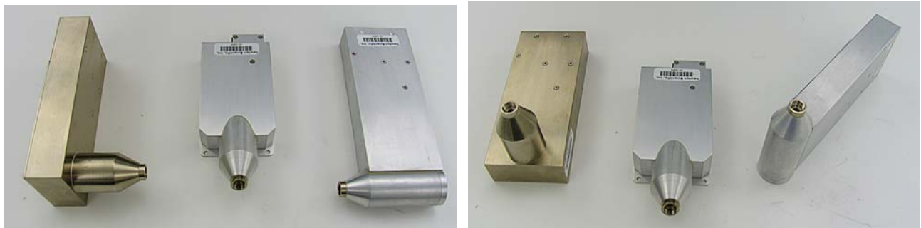
OEM X-ray tubes: Custom packaging to meet the unique demands of the OEM.